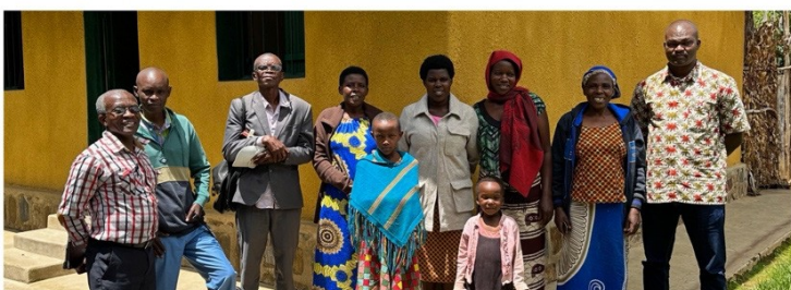
Nyamagabe and Nyaruguru