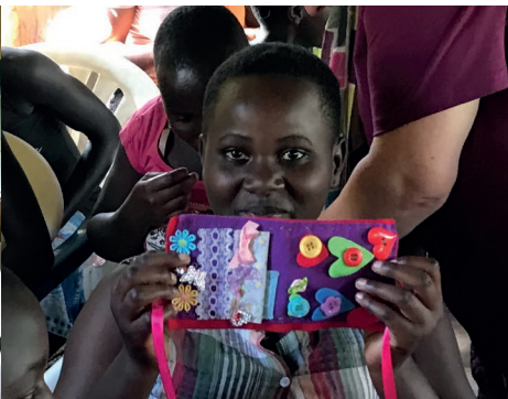
A finished needle book!