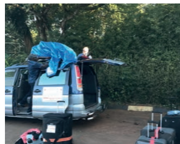
Packing the minibus for the journey to Mpondwe.

Many of the attendees were from the meetings in the area, but others came from various groups, the local brethren are in contact with. Many of them are believers and with some we could really notice the insight in divine things, whereas others are not saved yet. That is why during the camp the gospel also was preached daily. Please pray for those who have heard the gospel, but not yet