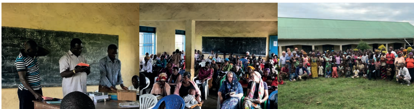
Double translation; Luganda-Lhukonzo-English