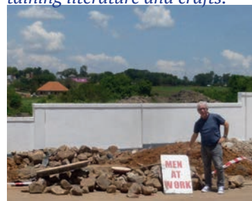
On the road to Mpondwe.