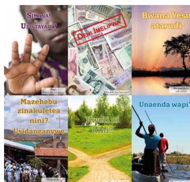
6 of the 15 gospel tracts in Swahili