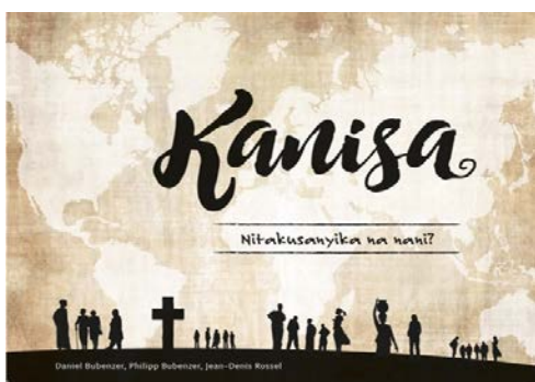
The booklet "The Church" in Swahili